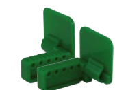
Endo posterior, qty. 2 items R/upper or L/lower and L/upper or R/lower Art. no. 2130100026