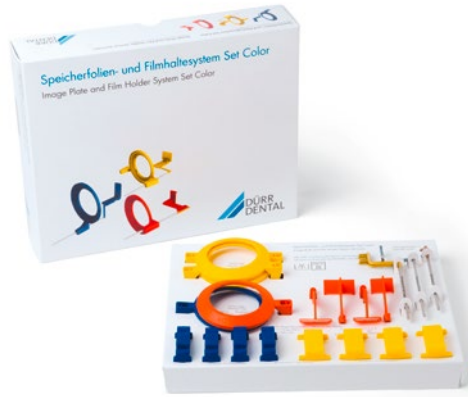
Image Plate and Film Holder System Set Color