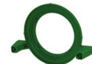
Endo Color aiming ring (green), qty. 1. Art. no. 2130100030