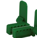
Endo anterior, qty. 2 items R/upper or L/lower and L/upper or R/lower Art. no. 2130100025