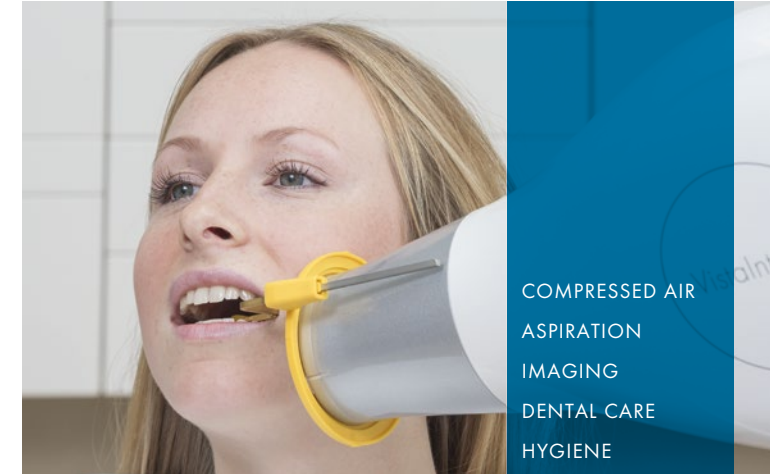
Image Plate and Film Holder System Set Color

COMPRESSED AIR ASPIRATION IMAGING DENTAL CARE HYGIENE