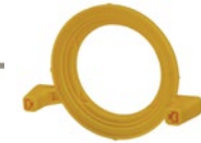
Color aiming ring posterior (yellow), qty. 1 Art. no. 2130100029