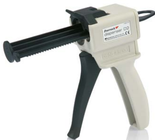
D2 - 4:1/10:1 dispenser