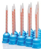
Mixing tips 4:1 (45 pcs)