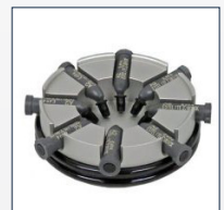
Standard Compu Tray