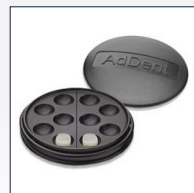
Porcelain Veneer Tray