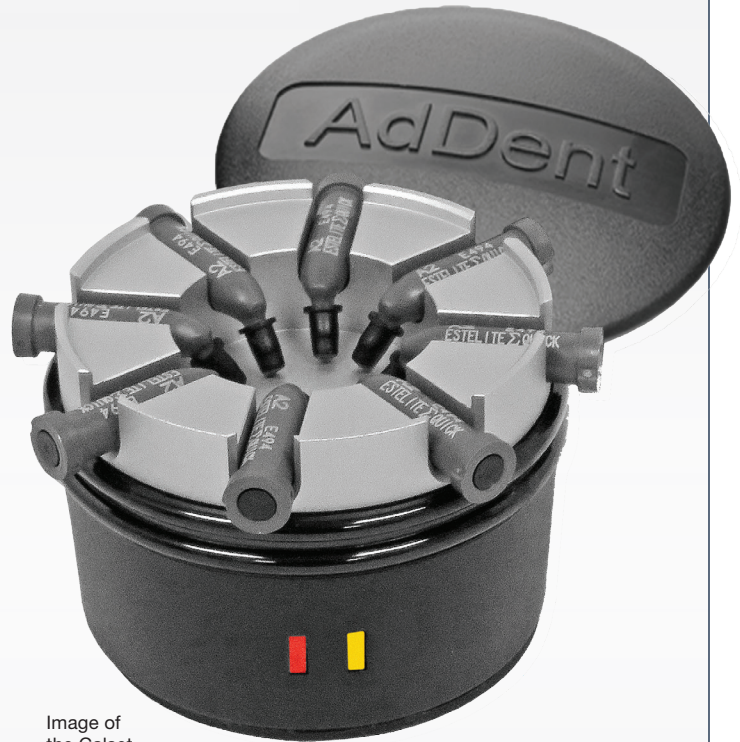
Image of the Calset Standard Tray