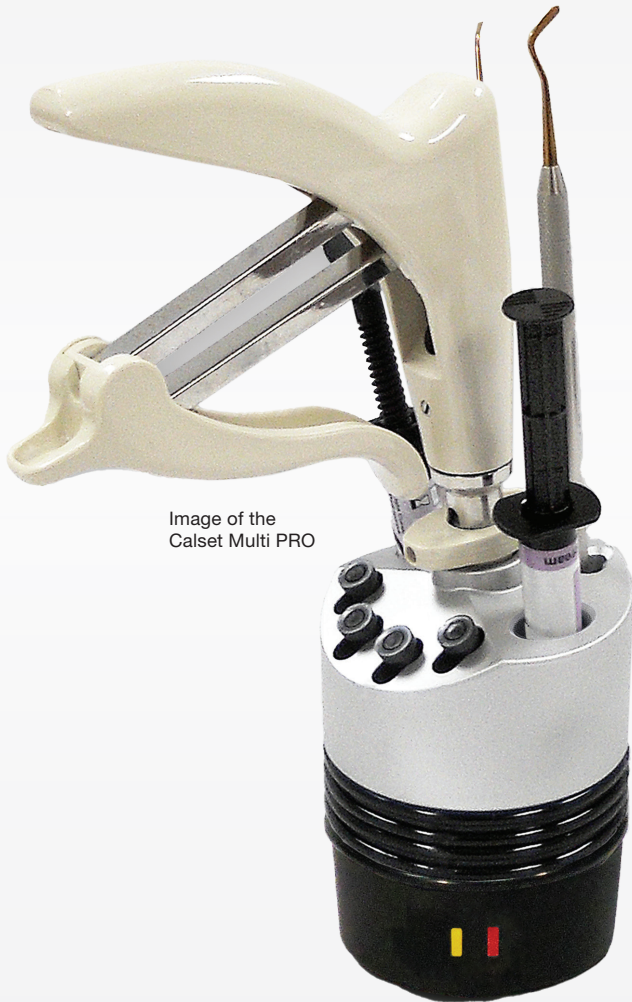
Image of the Calset Multi PRO