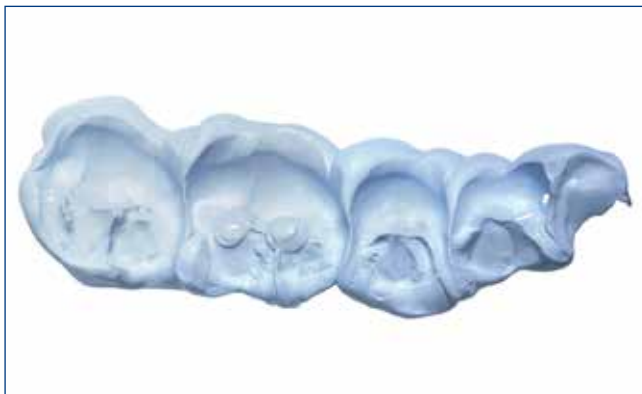
Digitisable occlusion record with special visual properties

Thanks to its special visual properties, optimised in brightness and contrast, Registrado Scan satisfies the strict requirements of digitalisation. Its visual properties allow trouble-free scanning of the occlusal record without using scanning powder. The occlusal record can be digitalised very quickly after its removal from the mouth without any additional steps.